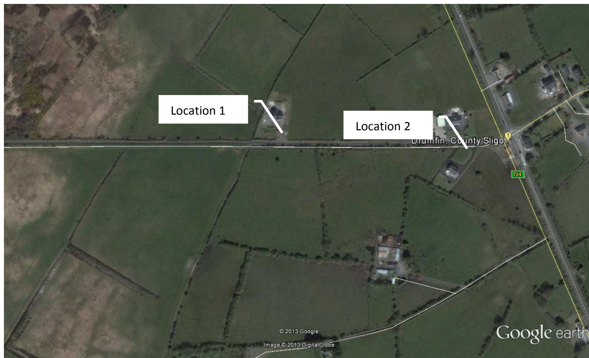
Figure 1-1: Noise survey locations

Location 2 is located in the vicinity of a number of residential dwellings to the east of the proposed sited.