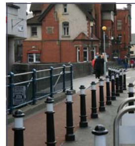
Recently completed works at Hyde Bridge were funded by the Dorman Accounts Fund & Sligo Borough Council