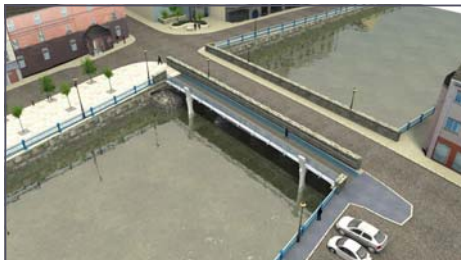
Impression of proposed pedestrian walk-way at Markievicz Bridge

'While traffic management is a major issue on a daily basis, we need the support of the general public in identifying traffic offenders, whether it is people parking on the footpath or parking illegally in disabled bays. Over a year ago we launched a 'text alert' facility to help counter this issue, and I would again ask people to report any problems to our dedicated text line..087 7850566