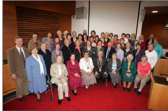
Members of the various Sligo Guilds of the ICA with elected members and the Cathaoirleach at the recent reception to celebrate 100 years of the Irish Countrywomen's Association