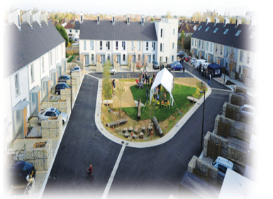
Successful Play Area