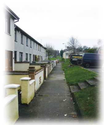
Issues With Existing Paths, Roads & Greens