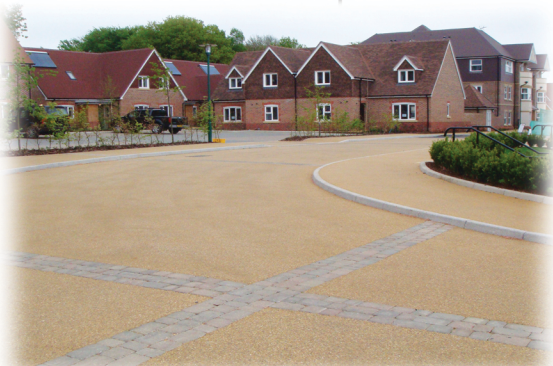
Shared Road Surface Encourages Safer Driving