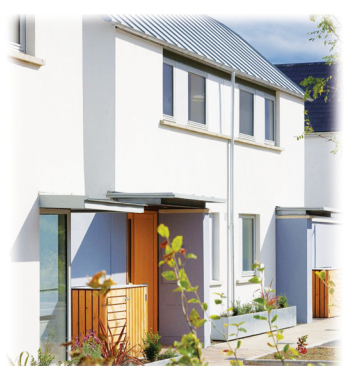
Successful Example of Coal Store