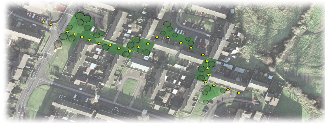
Pedestrian Green Link