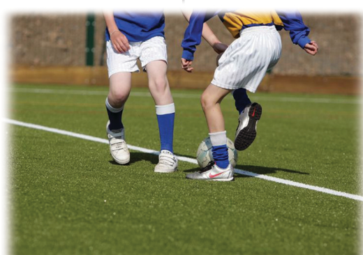
Safe Areas For Children To Play