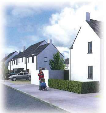
Corner Defined By Planting