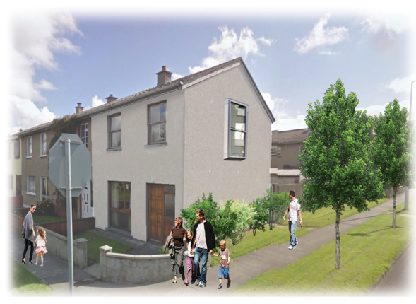
Potential for New Windows In End of Terraces: To Improve Supervision of the Streets, Such as Devins Drive