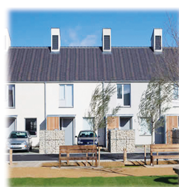
Successful Example of Bin Store