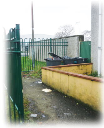
Issues With Existing Boundaries