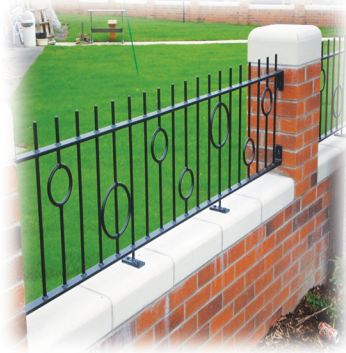
Improved Garden Walls