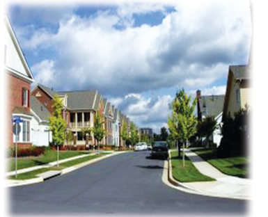
Upgrades To Neighbourhood Entrances