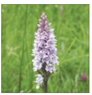
Common spotted orchid