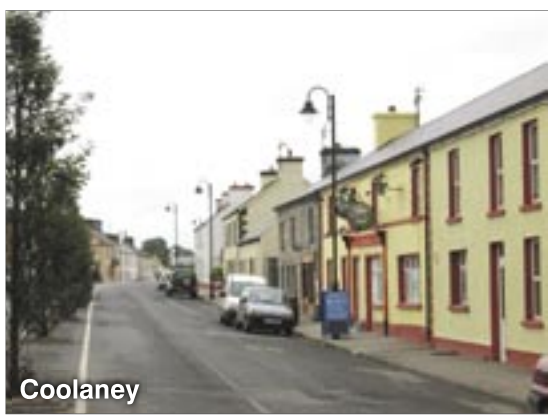
Concentrations of traditional building types contribute to the character of settlements