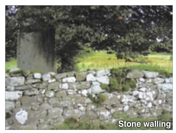
Non-structural elements make a significant contribution to our built heritage