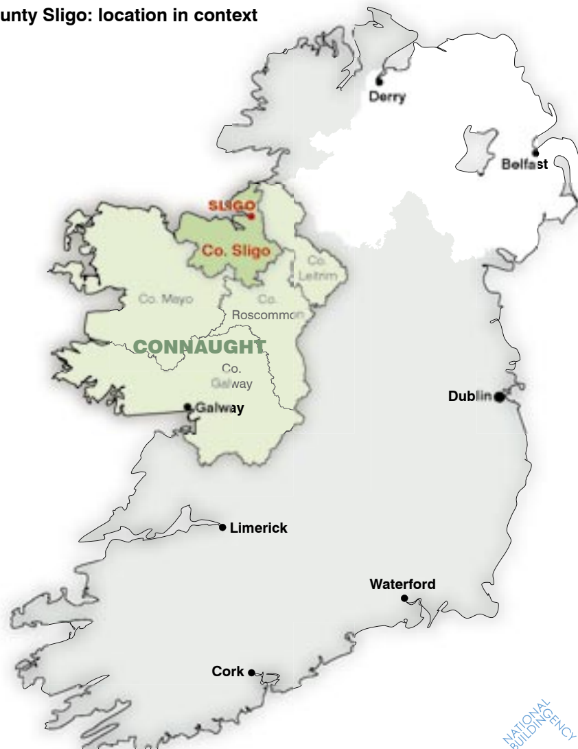
Fig. 1.a County Sligo: location in context