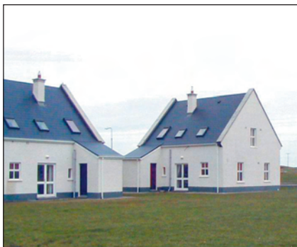
Holiday Homes, Enniscrone