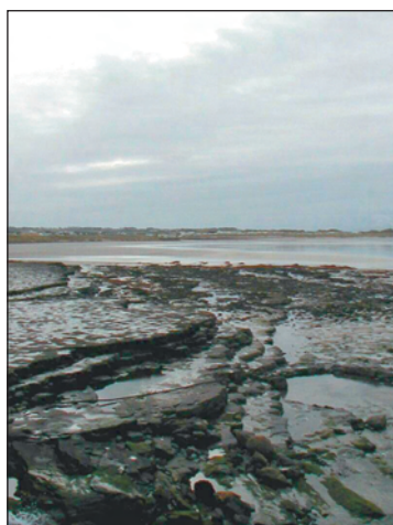
Coastal view of Enniscrone

Enniscrone is located along the west coast of County Sligo, bounded by Killala Bay and the Atlantic Ocean on its western front. The town lies approximately 43 miles (69km) west of Sligo City and the nearest centre of significant population is Ballina, which is located 8.5 miles (14.3km) south west. The R297 forms the main road through Enniscrone, connecting to the N59 6km from the centre of the town, providing the link to both Ballina and Sligo City. Located approximately 50km from Enniscrone is Sligo Regional Airport.