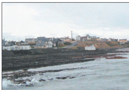
Overview of Enniscrone Town