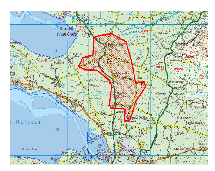
Page 29 of 32