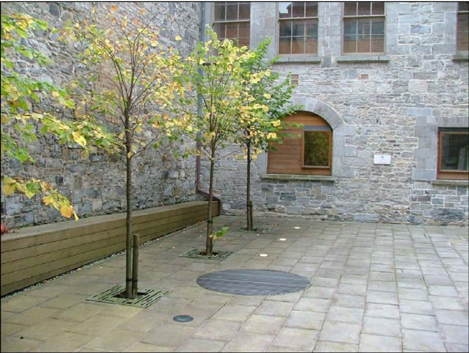
50. Example of courtyard development with planting