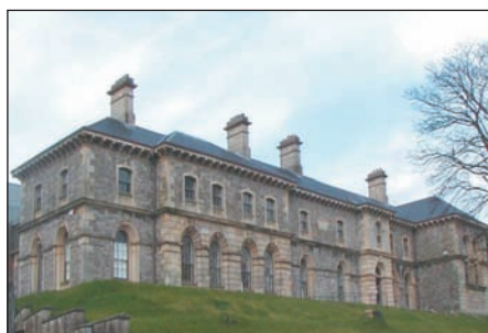
The Model Arts and Niland Gallery Building, Sligo

North of the river, the Model Arts and Niland Gallery site is located in what can loosely be termed Sligo's cultural quarter. This area is the subject of a competition and a bid to North-West Tourism for further funding and development. Strong linkages between this area and the city centre should be maintained so as to encourage 'event' shoppers to make combined trips. The local authority will also support the development of this area as the city's cultural quarter.