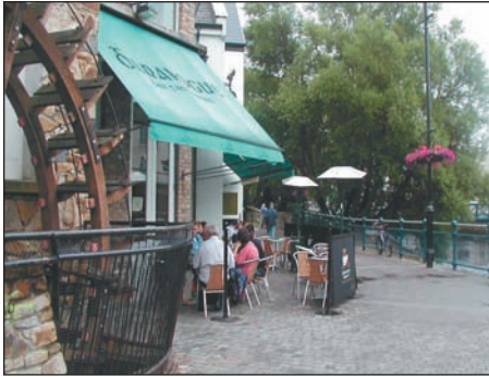
Cafe Culture, Sligo