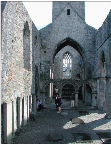
The Abbey, Sligo

The Abbey is the only nationally recognised Heritage site in Sligo City and the city's only surviving medieval building. It has potential to be promoted as a more prominent feature and as a symbol of the city. Although now a ruin, the remaining structure is in good condition, with many of the tombs, monuments and features retaining much of their original splendour. It has the oldest high altar in any Irish monastic church, dating to the 15 th century. The Abbey is under state care and managed through Duchas, the Heritage Service.