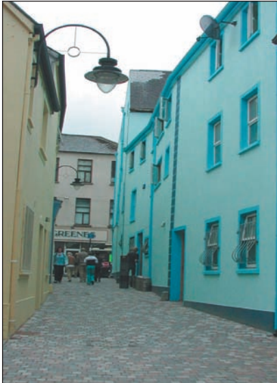
Pedestrian access, Sligo