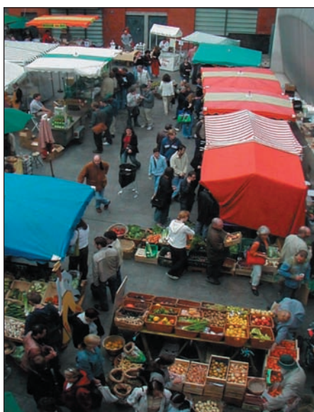
Temple Bar Market, Dublin

The area around Stephen Street Car-Park in Sligo offers a suitable amenity area that is not used to its full potential at present. High quality urban design exists on the opposite bank at Rockwood Parade and also to some extent on the north riverbank towards Hyde Bridge. However, the scenic potential of the area could be maximised with the removal of existing car parking at the Stephen Street car-park, which currently acts as a barrier to any further improvements to the riverside setting. Furthermore, it does not currently act as an incentive for pedestrians, particularly event shoppers and tourists, to explore the north bank of the city. As a result the potential benefits of the footbridge are not fully realised.