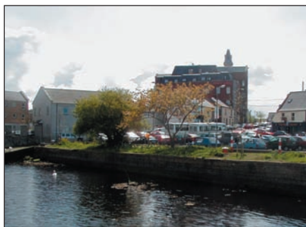
View of Quay Street Car-Park, Sligo

The location of ticketing outlets for Iarnród Éireann and Bus Éireann on the central civic square would also be of considerable benefit, with the possible provision of a pedestrian sky-walk over the Inner Relief Road providing direct access from the square to the station and resolving the problem of severance of the bus and train stations from the city centre.