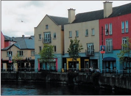
Rockwood Parade Riverfront, Sligo

At such a key location it may be necessary for the licensing authority to place restrictions on the range of goods sold. The market would provide a platform for local artists, craftspeople, locally produced organic food, and specialist hot food stalls. The aim is a high quality urban amenity that will appeal to the tourist and event shopper alike.