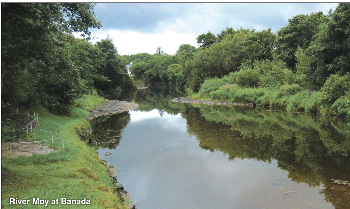
River Moy at Banada