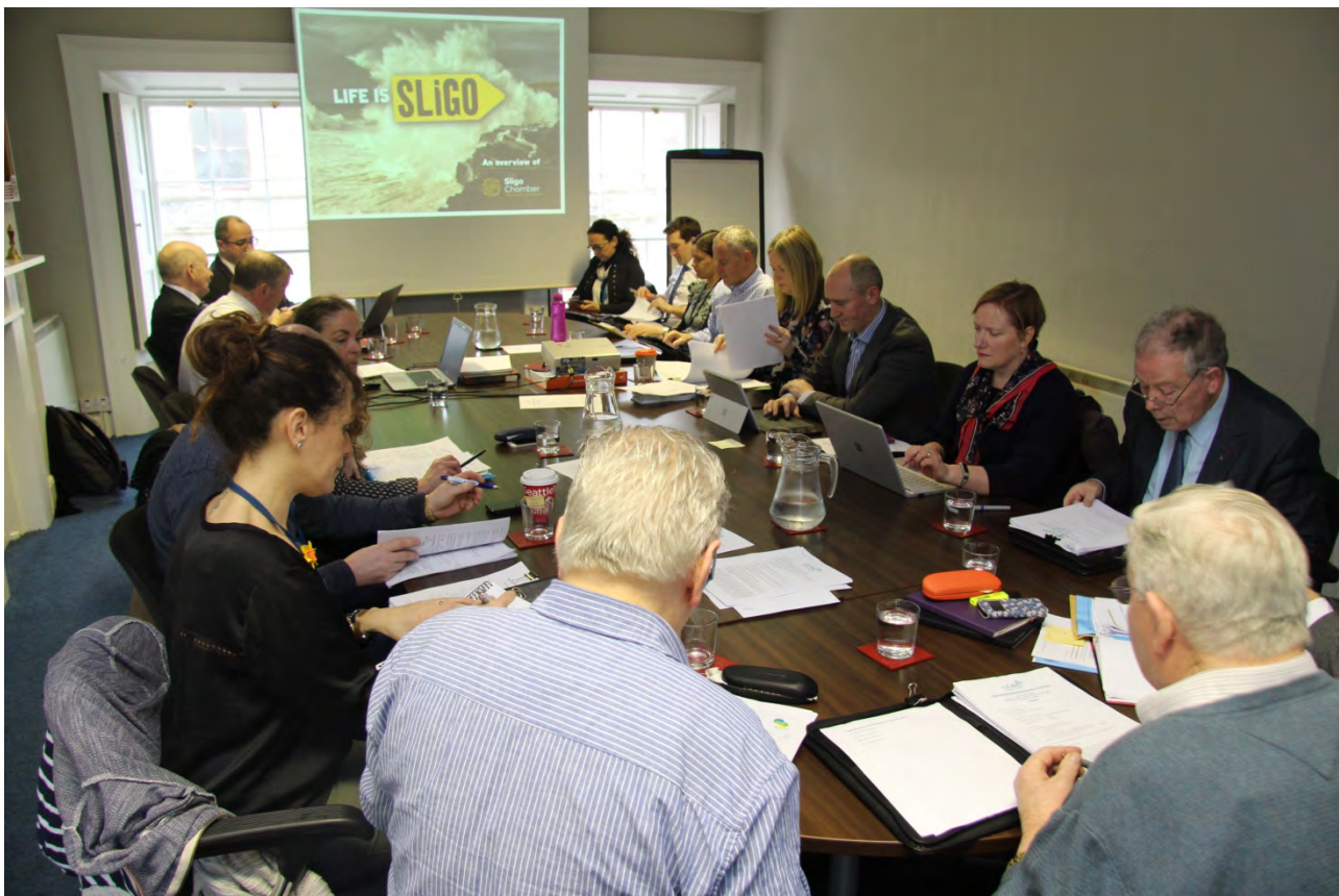
LCDC in session in February 2019 – Sligo Chamber of Commerce hosted this meeting