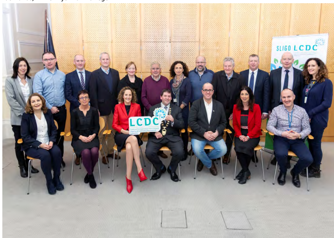
Members of Sligo LCDC with support staff, December 2018