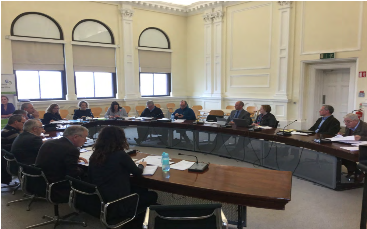
LCDC in session in the Council Chamber, City Hall