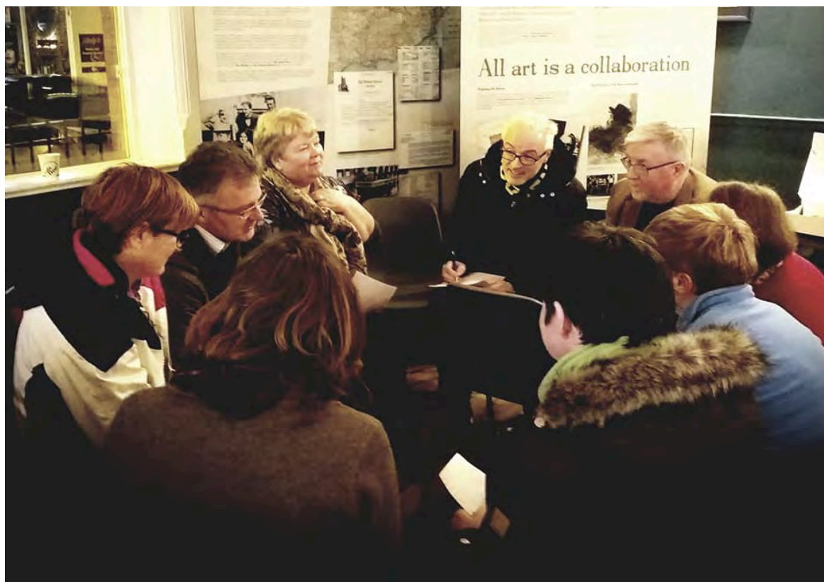
Participants of the Heritage Programme at a workshop in March 2018