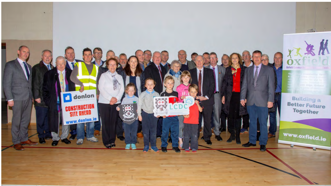
Visit by Michael Ring TD to Oxfield Community Sports & Leisure Centre, Drumcliffe, Co. Sligo on 15 th November 2018

From the 1st February 2019, Local Authorities in their role as Lead Financial Partner (LFP), in each LCDC LAG area are tasked with undertaking Article 48 Checks, on projects and claims, with the exception of “In-House” projects delivered directly by the LAG or Implementing Partner (IP) where Pobal will continue to perform Article 48 checks. Pobal will also carry out checks on Monthly administration claims.