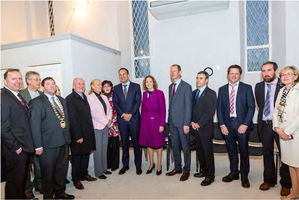
An Taoiseach Leo Varadkar visiting the Reading Wing, St. Paul's Church, Collooney, Co. Sligo in November 2018