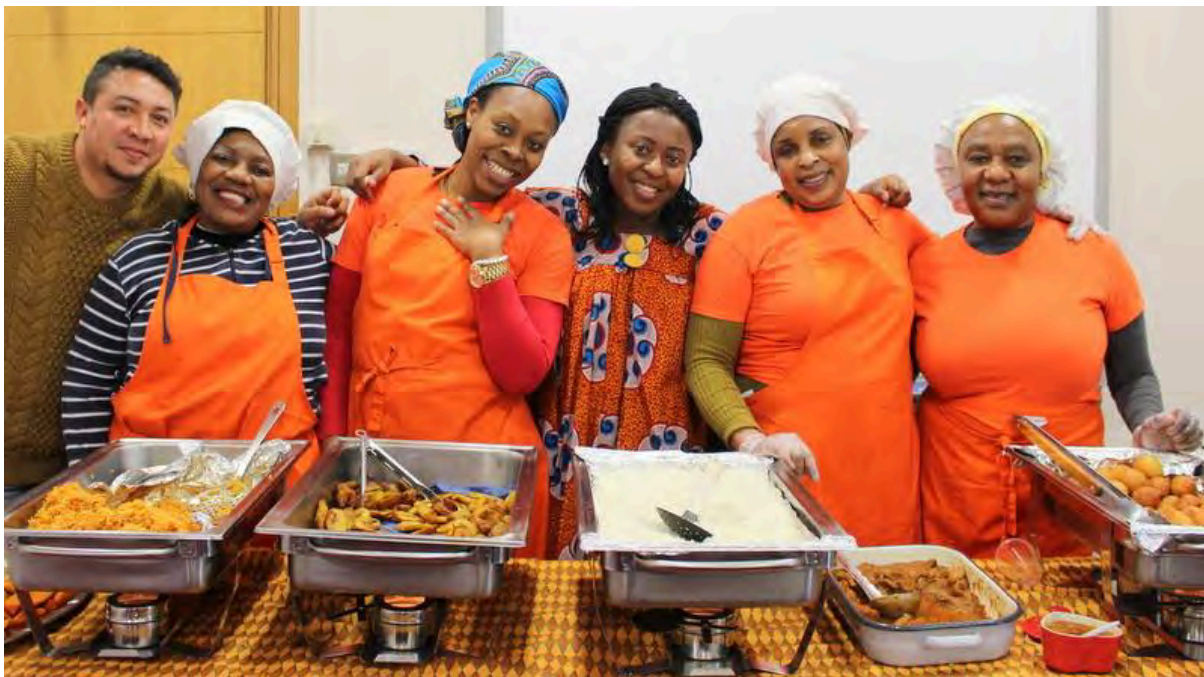
Sligo Global Kitchen – celebration of Christmas from across the Globe – Sligo Community Celebration event 7 th December 2018