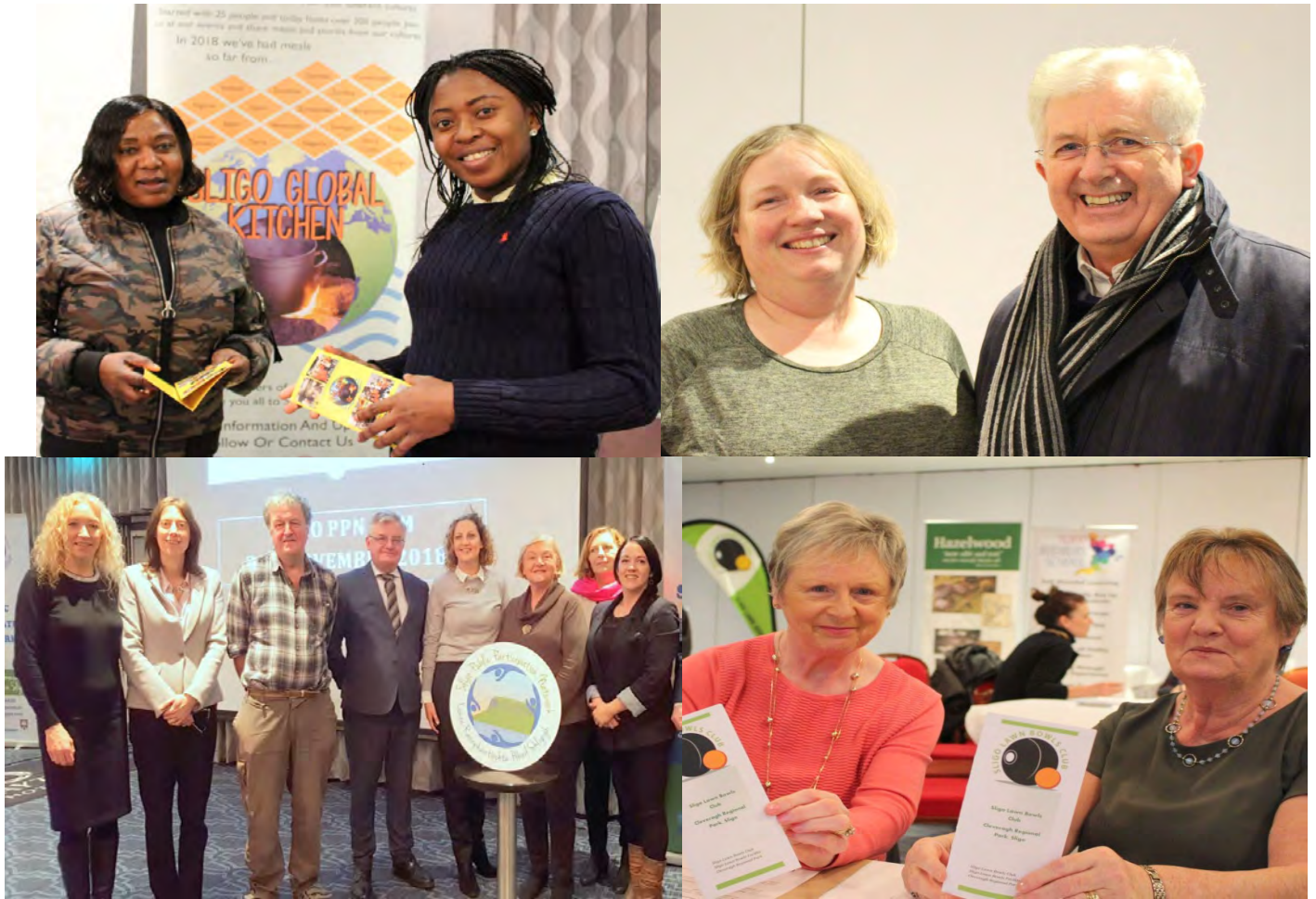
PPN AGM November 2018