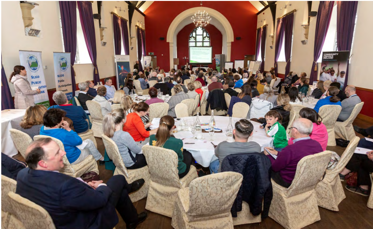
Attendees at the Grants Information event held on 11 April 2019 in a partnership arrangement between SCC/Sligo PPN/Sligo Leader Partnership/Sligo Volunteer centre and MSLETB

On the night presentations were given on the key upcoming grants for Sligo County Council/LCDC e.g. Community Enhancement Programme, Healthy Ireland, Community and Voluntary grants, Anti Litter and Graffiti and Agenda 21 and other funding opportunities available from the MSLETB and Sligo LEADER Partnership CLG.