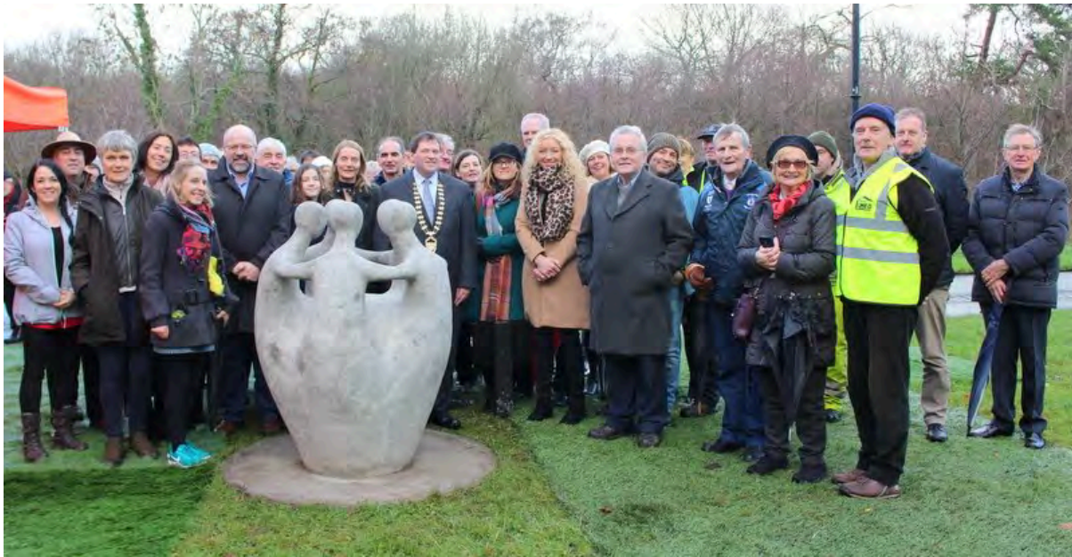
7 th December 2018 - Sligo Community Celebration event acknowledging the work of volunteers in Sligo and unveiling the PPN commissioned Art piece in Doorly Park