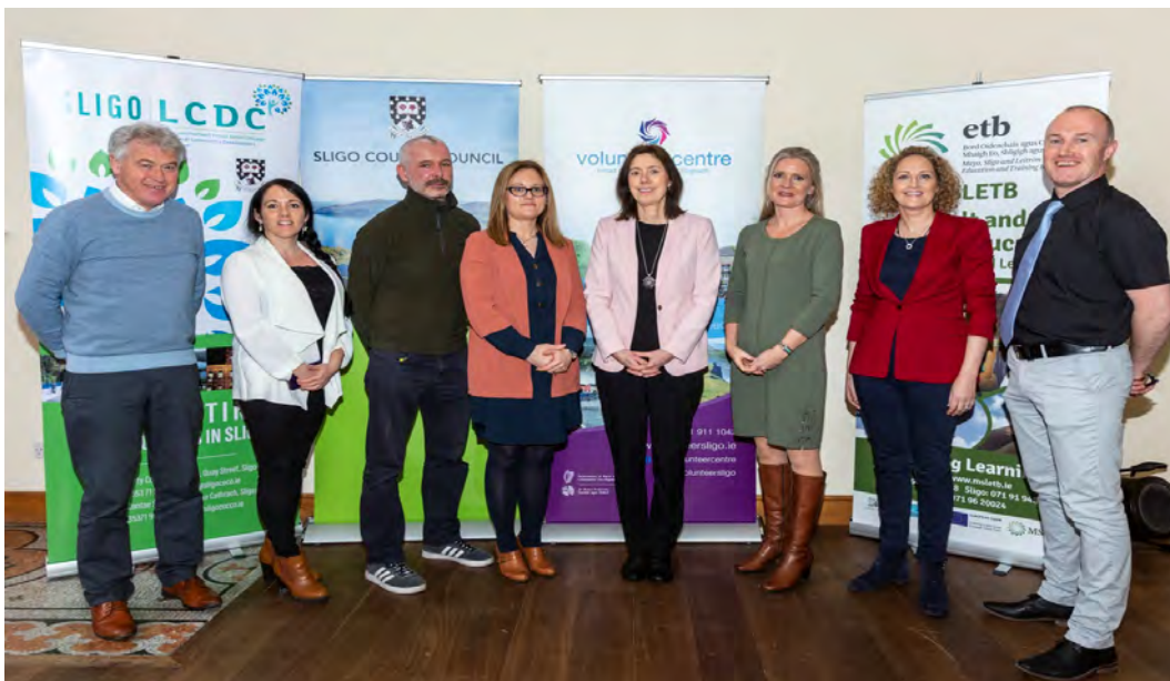
Speakers at the Grants Information event from Sligo County Council, Sligo PPN, Sligo Volunteer Centre, Mayo Sligo Leitrim ETB and Sligo LEADER Partnership CLG