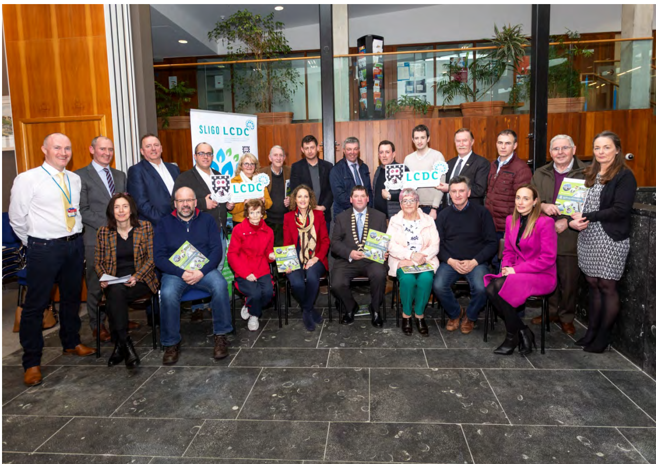
Members of Sligo County Council and Sligo LCDC with beneficiaries under the Community Enhancement Programme 2018 at Teach Laighne, Tubbercurry on the 25th March 2019