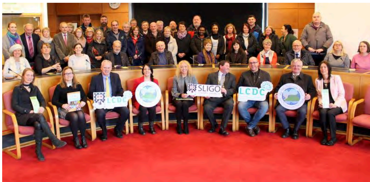
Some of the attendees at the Sligo Community Celebration collaborative event on the 7th December 2018