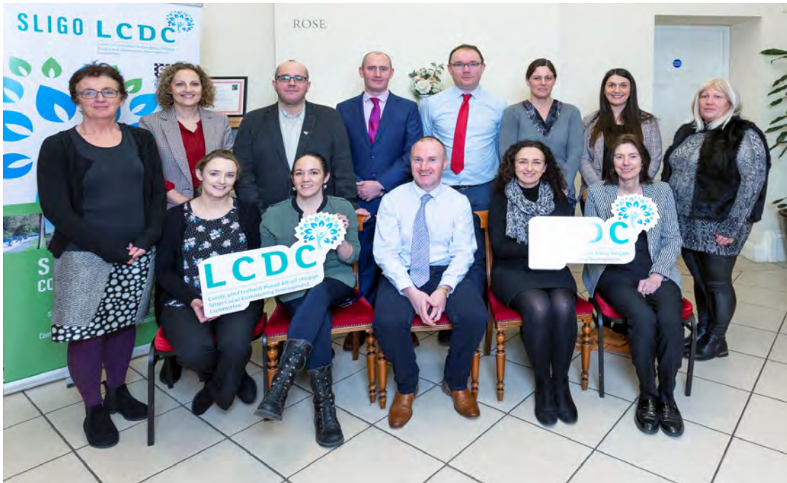
Members of Sligo LCDC & staff at the Community Enhancement Programme event in City Hall 5th February 2019