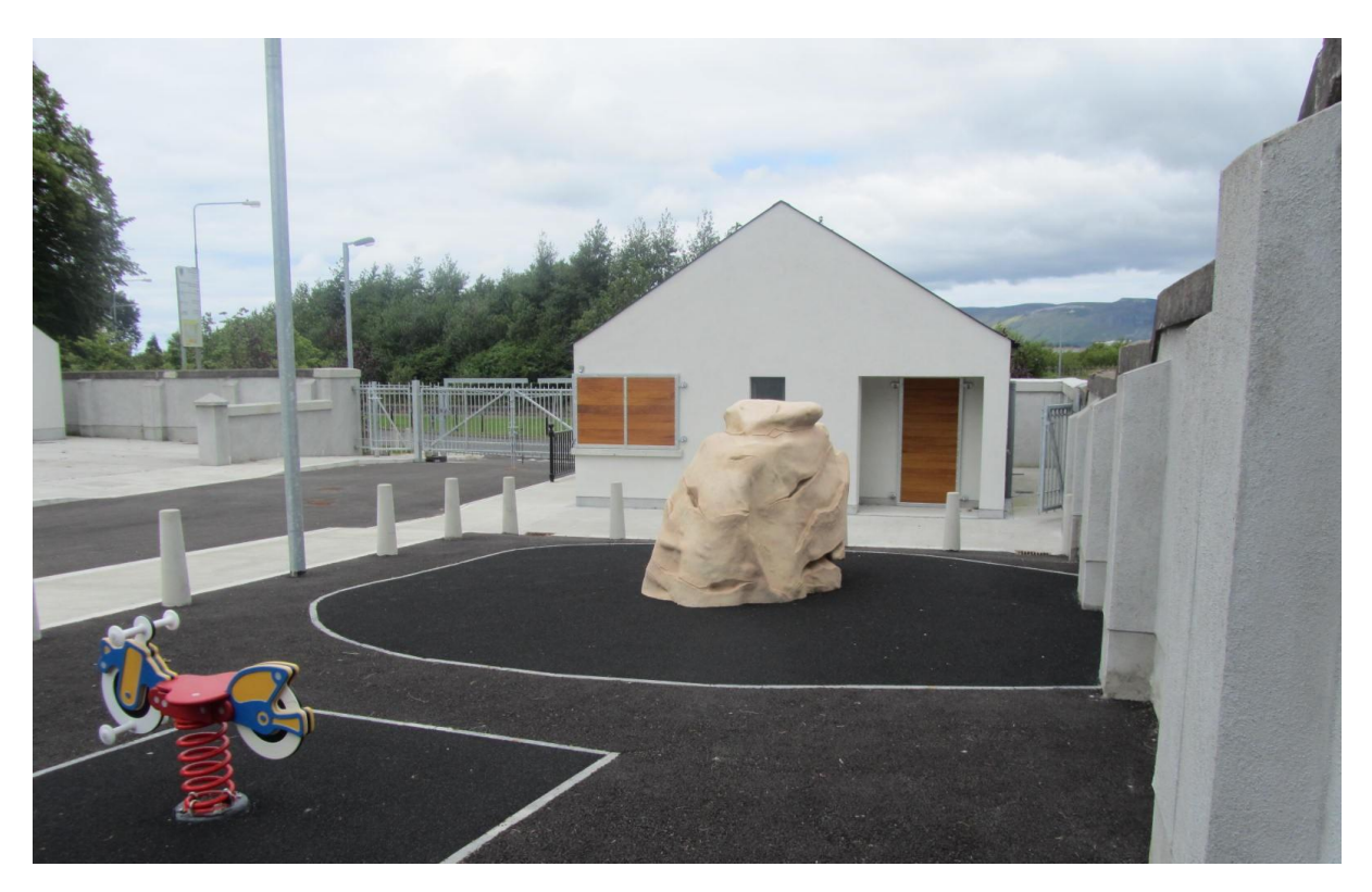
Alma Terrace Halting site play area

Alma Terrace was renovated in 2010. Sligo County Council will continue to maintain the site and allocate the units in accordance with its allocation policy.