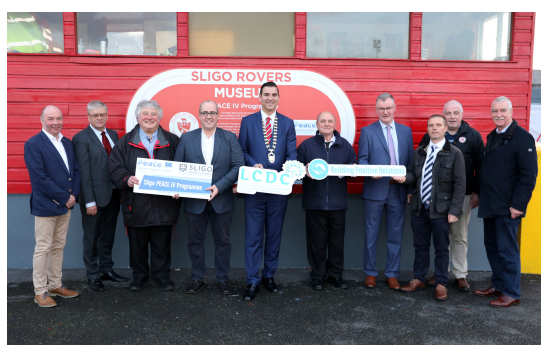
Above- Sligo Rovers - Launch of the Showgrounds Outdoor Museum, October 2019