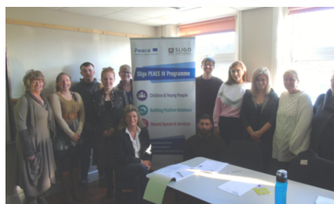
Above - Northside Community Partnership - Participants in the Pathways to Mediation Project in Derry March 2019