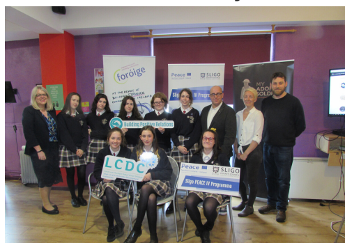
Above - Foroige - Launch of the Digital History Project, September 2019