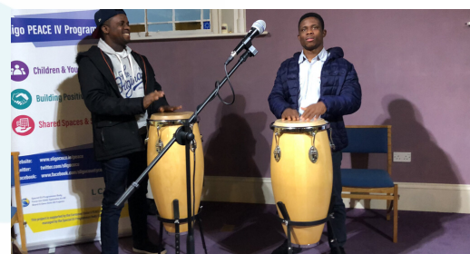
Above - Yeats Society - Performers at the first Salon successfully held in Sligo in March 2019