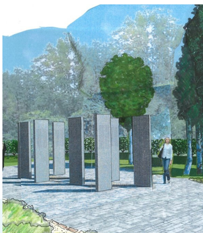
Above - Lest Sligo Forgets - Indicative drawing of the World War 1 Memorial Garden to be developed at Cleveragh